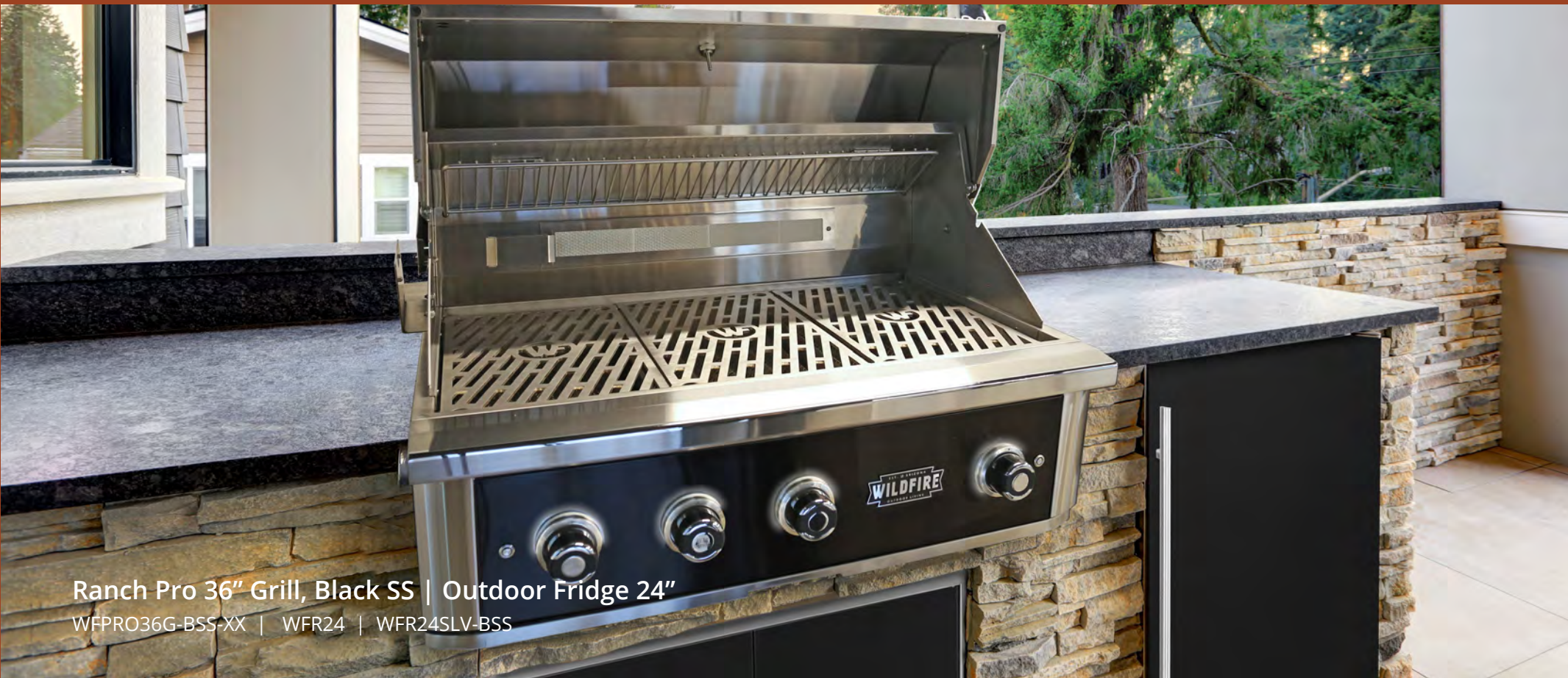
Ranch Pro 36" Grill, Black SS | Outdoor Fridge 24"

Reach for a cold drink or store fresh food; our fridge and ice chest add function and style to your outdoor kitchen.