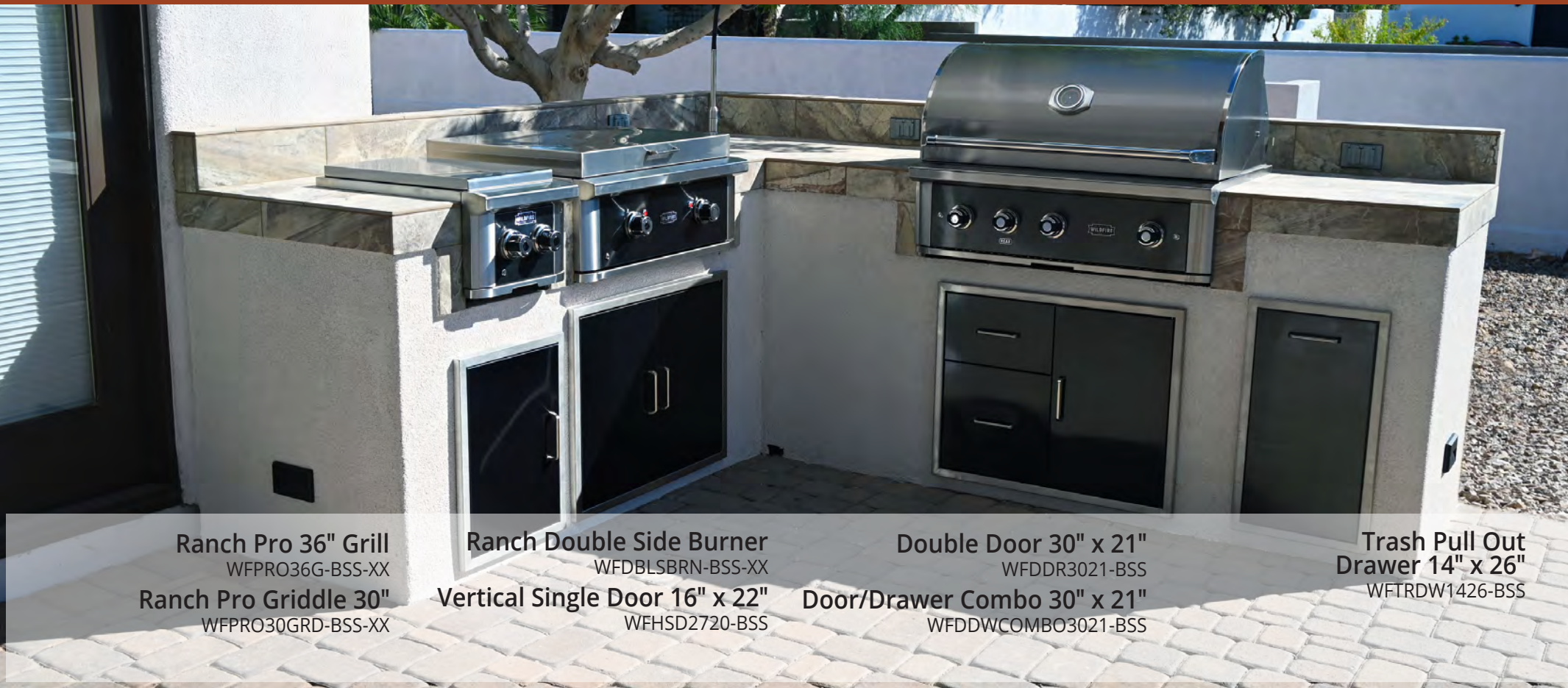
Ranch Pro 36" Grill WFPRO36G-BSS-XX

You can never have too much storage. Keep your favorite grilling tools close at hand with your choice of drawers and doors in our signature Black or Traditional 304 Stainless Steel finish.