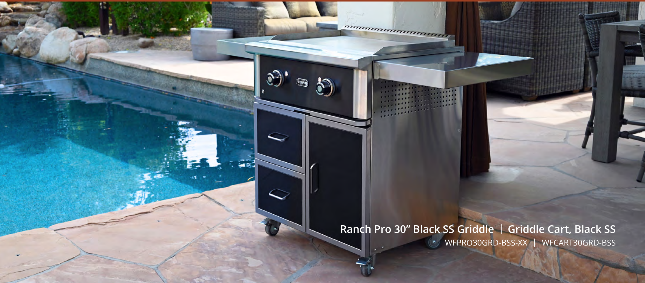
Ranch Pro 30" Black SS Griddle | Griddle Cart, Black SS WFPRO30GRD-BSS-XX | WFCART30GRD-BSS

Effortlessly smooth cooking from breakfast to dinner. Stainless steel surface griddle is perfect for cooking griddle type foods.