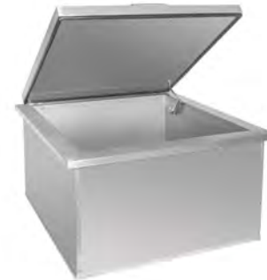
ICE CHEST (LARGE) • 304 Stainless Steel Finish • Built-in Design • 24 3/8" x 25 3/8" x 17" # WF-LIC