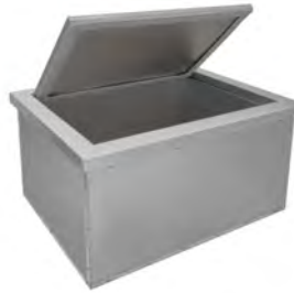
ICE CHEST (SMALL) • 304 Stainless Steel Finish • Built-in Design • 25" x 18" X 15" # WF-SIC