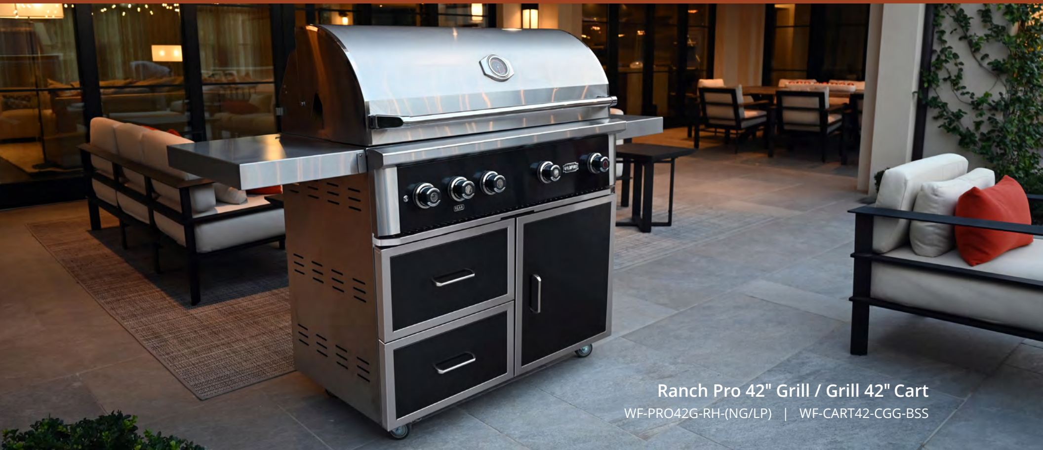
Ranch Pro 42" Grill / Grill 42" Cart WF-PRO42G-RH-(NG/LP) | WF-CART42-CGG-BSS

Looking for the perfect spot to grill? Our grill and griddle carts make it easy for you to set up anywhere. Mobile? Yes. But our carts pack the same top-quality construction, function and looks as our island grills.