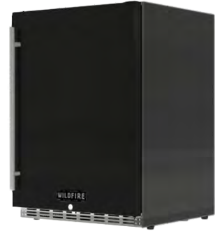
24" FRIDGE BLACK SLEEVE • Fits # WFR-24-BSS # WFR-24SLV-BSS