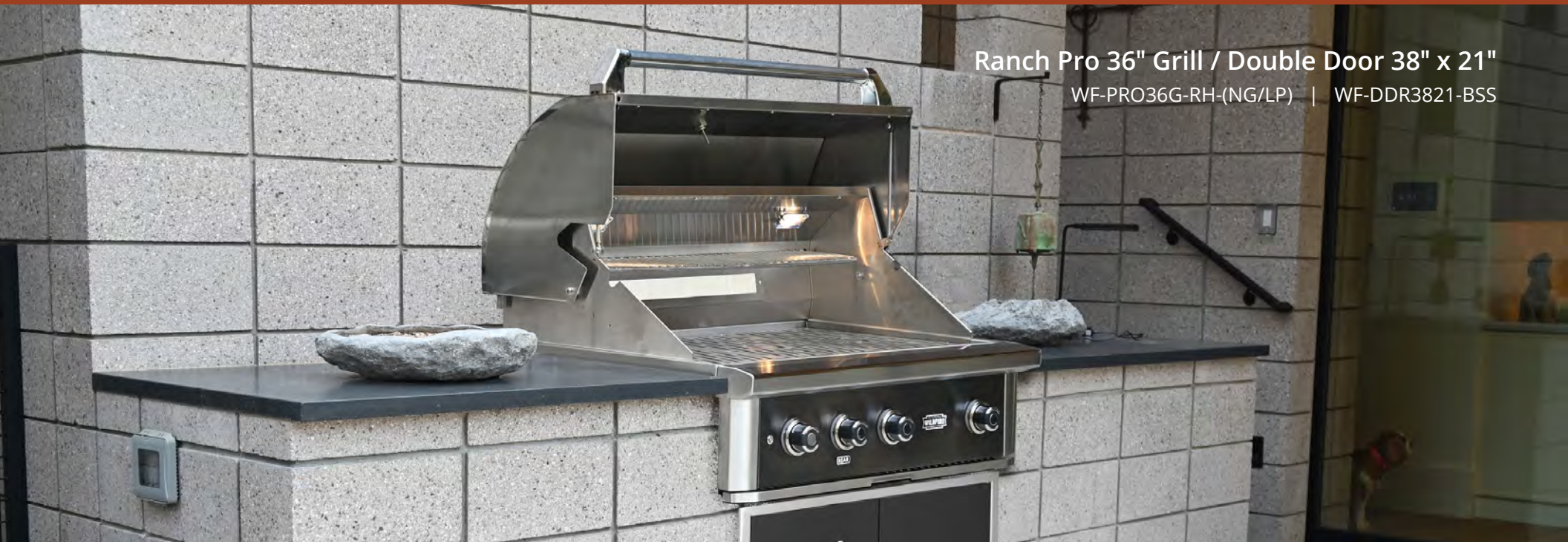
Ranch Pro 36" Grill / Double Door 38" x 21"

Delivering a modern outdoor cooking and grilling experience is at the heart of what we do. Our team of BBQ experts, mechanical engineers and industrial designers crafted a collection that brings the comfort of indoor cooking to the outdoors for a more rugged experience.