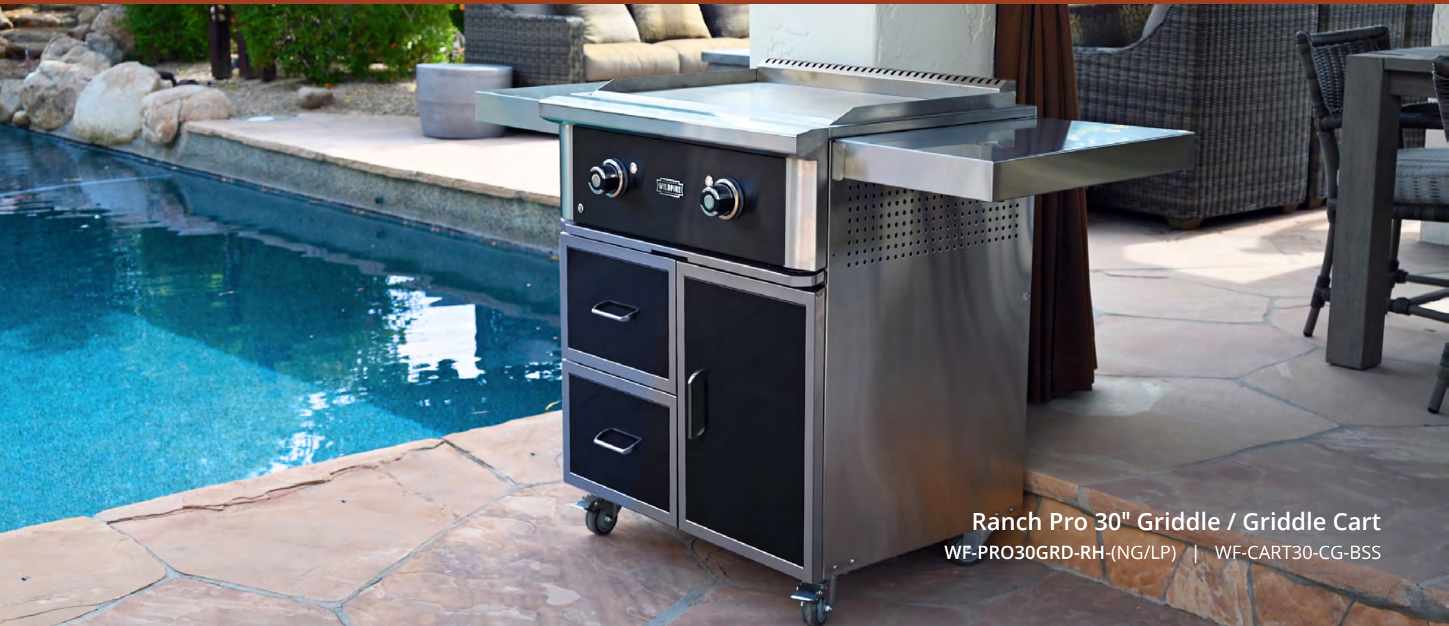
Ranch Pro 30" Griddle / Griddle Cart WF-PRO30GRD-RH-(NG/LP) | WF-CART30-CG-BSS

Effortlessly smooth cooking from breakfast to dinner. Stainless steel surface griddle is perfect for cooking your favorite type foods.