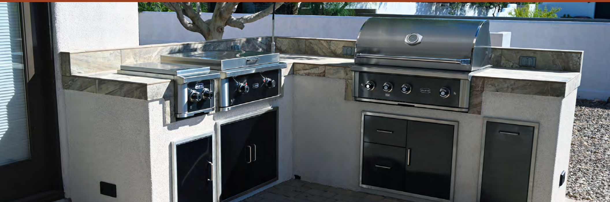
Ranch Pro 36" Grill WF-PRO36G-RH-(NG/LP)

You can never have too much storage. Keep your favorite grilling tools close at hand with your choice of drawers and doors in our signature Black 304 Stainless Steel finish.