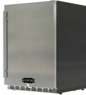
24" OUTDOOR FRIDGE • 304 Black Stainless Steel Finish • Built-in Design • 5.3 CU.FT. # WFR-24