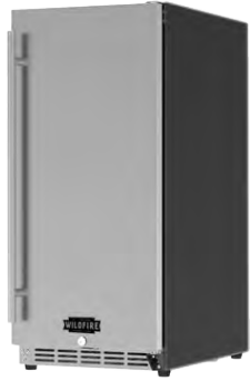
15" OUTDOOR FRIDGE • 304 Black Stainless Steel Finish • Built-in / Slide-in Design • 3.2 CU.FT. # WFR-15