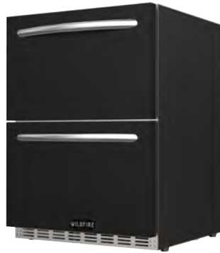
24" DUAL DRAWER FRIDGE Fits # WFRDD-24-BSS # WFRDD-24SLVBSS