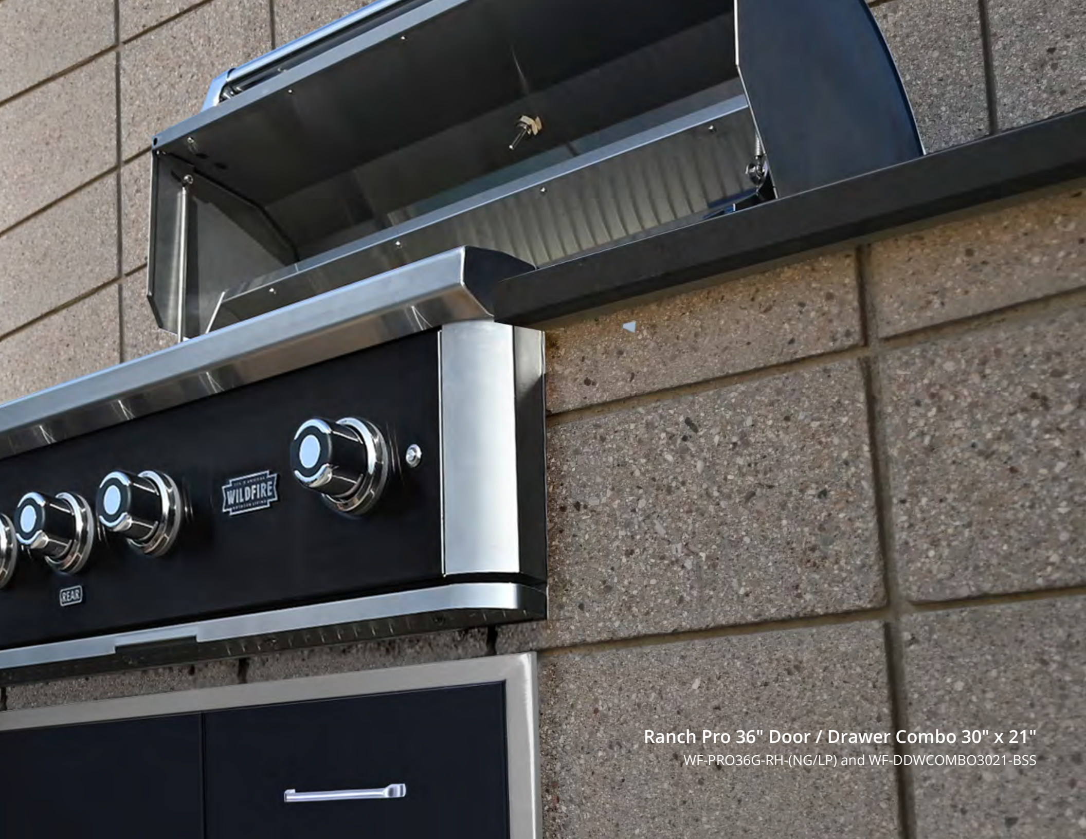
Ranch Pro 36" Door / Drawer Combo 30" x 21" WF-PRO36G-RH-(NG/LP) and WF-DDWCOMBO3021-BSS