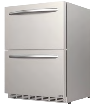
24" DUAL DRAWER FRIDGE • 304 Stainless Steel Finish • Built-in / Slide-in Design • 5.3 CU. FT. # WFRDD-24