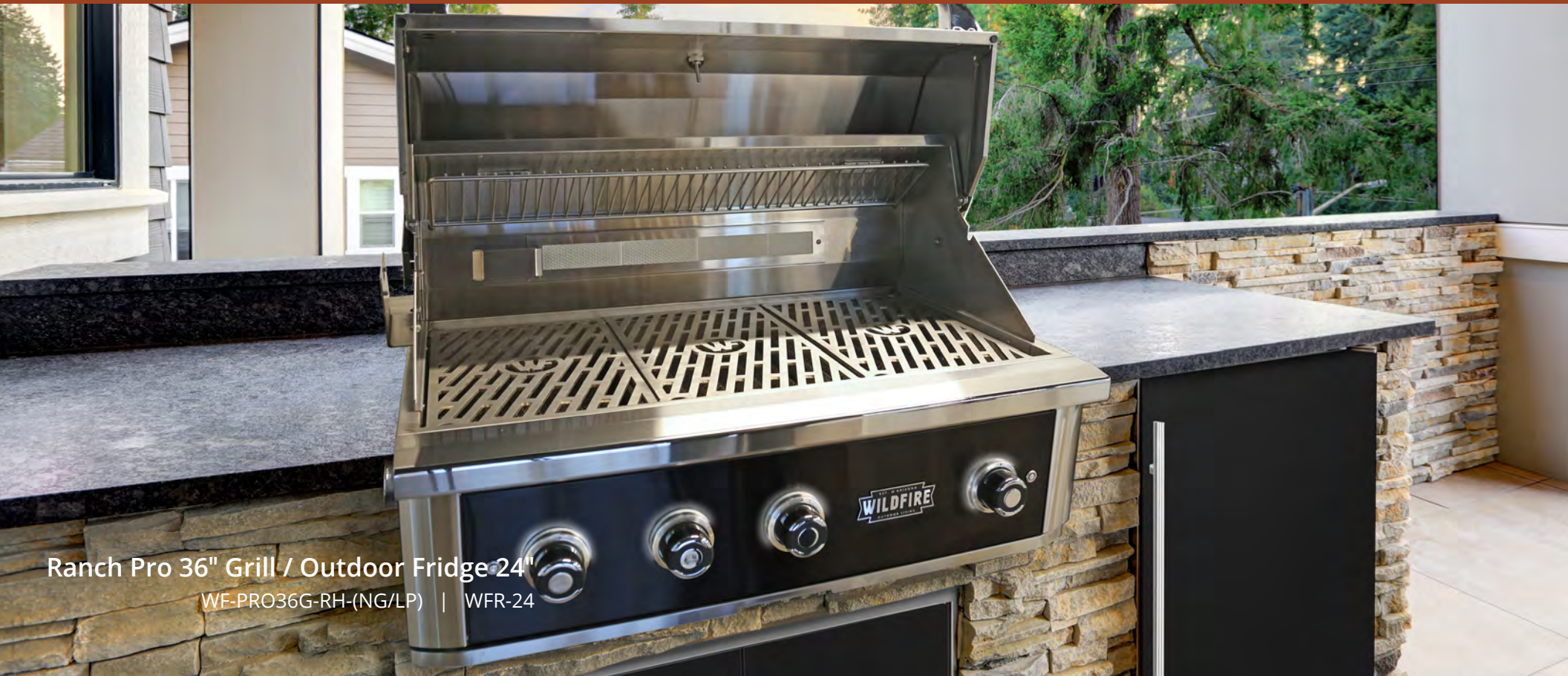
Ranch Pro 36" Grill / Outdoor Fridge 24"

Reach for a cold drink or store fresh food; our fridge and ice chest add function and style to your outdoor kitchen.