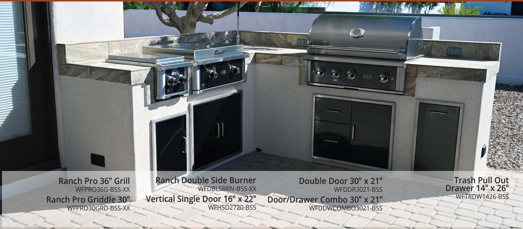
Ranch Pro 36" Grill WFPRO36G-BSS-XX

You can never have too much storage. Keep your favorite grilling tools close at hand with your choice of drawers and doors in our signature Black or Traditional 304 Stainless Steel finish.