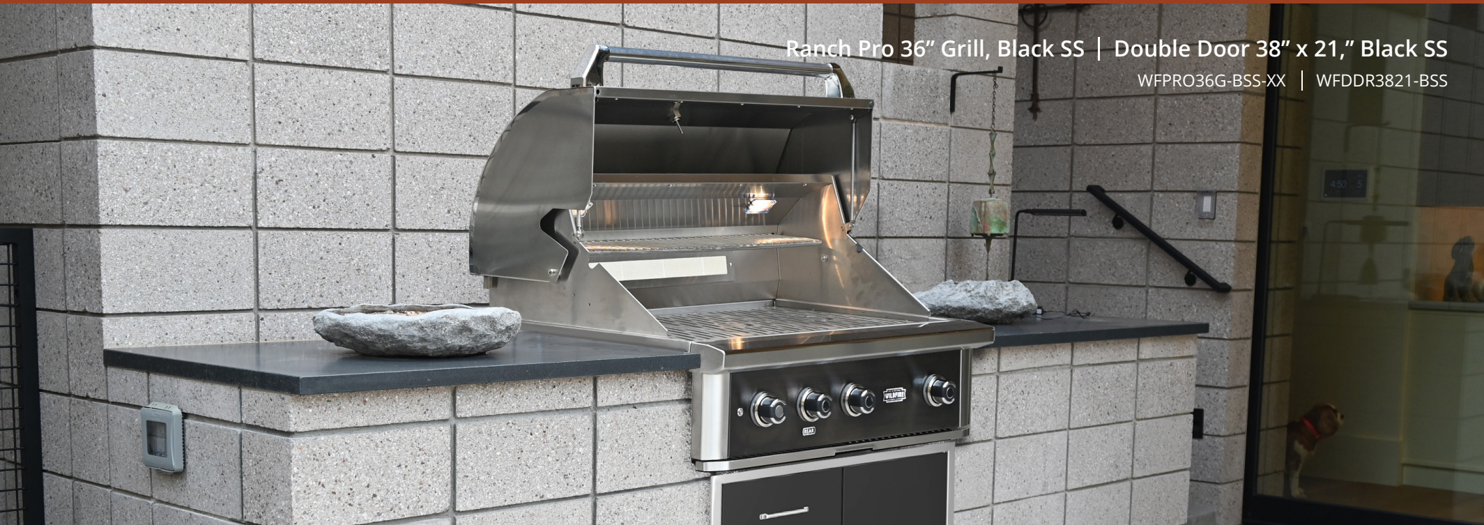
Ranch Pro 36" Grill, Black SS | Double Door 38" x 21," Black SS

Delivering a modern outdoor cooking and grilling experience is at the heart of what we do. Our team of BBQ experts, mechanical engineers and industrial designers crafted a collection that brings the comfort of indoor cooking to the outdoors for a more rugged experience.