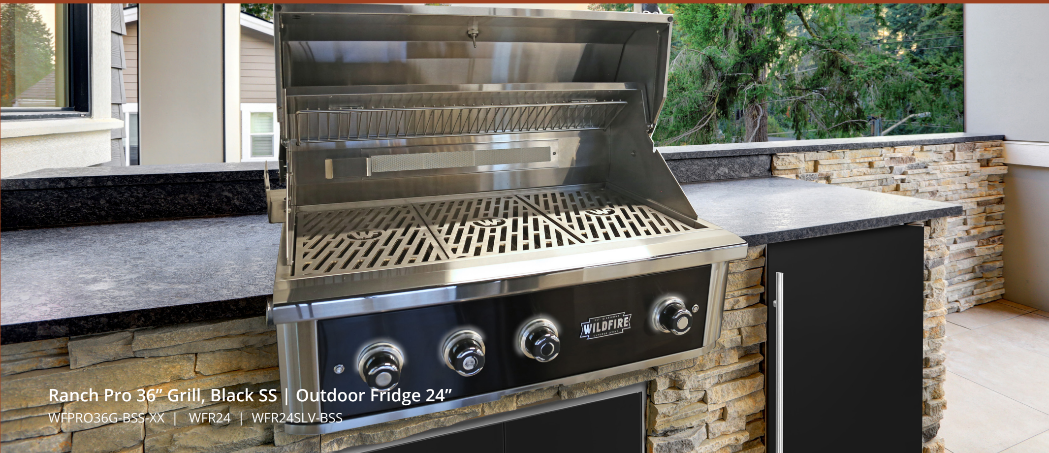
Ranch Pro 36" Grill, Black SS | Outdoor Fridge 24"

Reach for a cold drink or store fresh food; our fridge and ice chest add function and style to your outdoor kitchen.